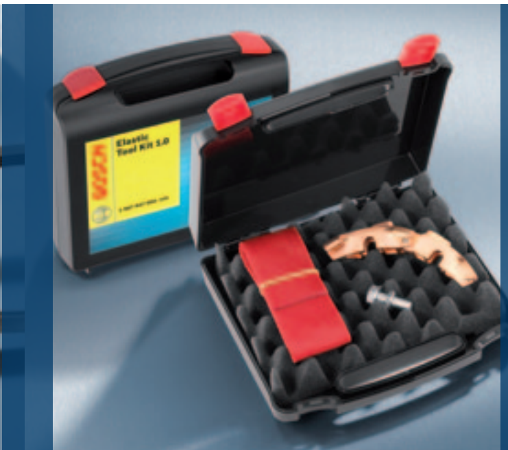
Elastic Tool Kit: universal assembly tool in practical case

You can count on this: After quick and easy installation the elastic ribbed V-belt from Bosch does not need to be re-tensioned, even during intensive continual use. It provides optimal tension – always. The advantage: The elastic ribbed V-belt from Bosch effectively counters an overload of the driven components caused by overtension. It also avoids inadequate power transmission and noise at too low tension. The combination of highly modern synthetic rubbers and extremely hardwearing