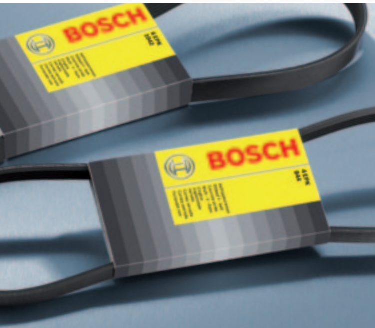
Bosch elastic ribbed V-belts for cars