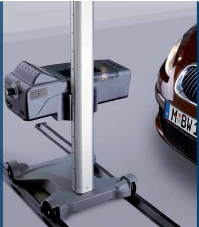
Ergonomic use on the vehicle – rotatable display by 180 degrees