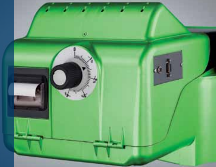
Integrated printer for documentation of test results even without PC connection

The Bosch HTD 615 is a photodiode headlamp adjustment device for reliable monitoring and evaluation of all common headlight systems. The test procedure is user-guided with visual and acoustic signals. Special functions support the adjustment. The design is ruggedly constructed for use in the workshop and enables ergonomic operation. The adjustment is reliable with laser technology and fast microcontroller.